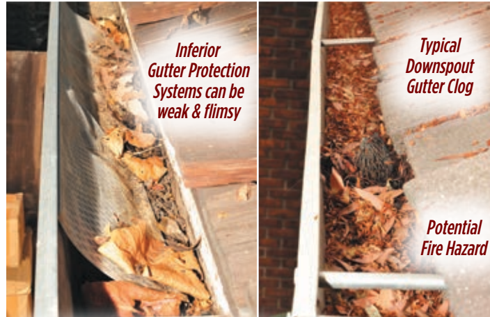
Inferior Gutter Protection Systems can be weak & flimsy