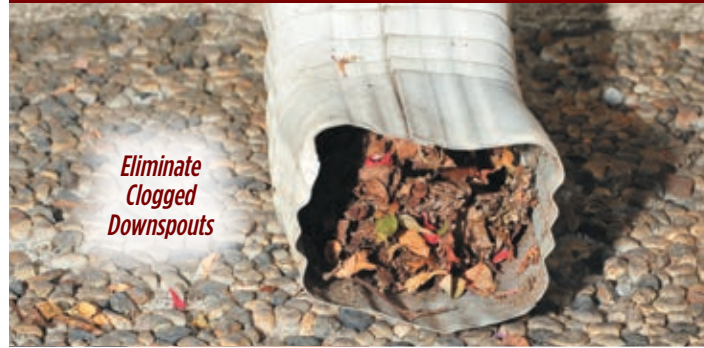
Eliminate Clogged Downspouts